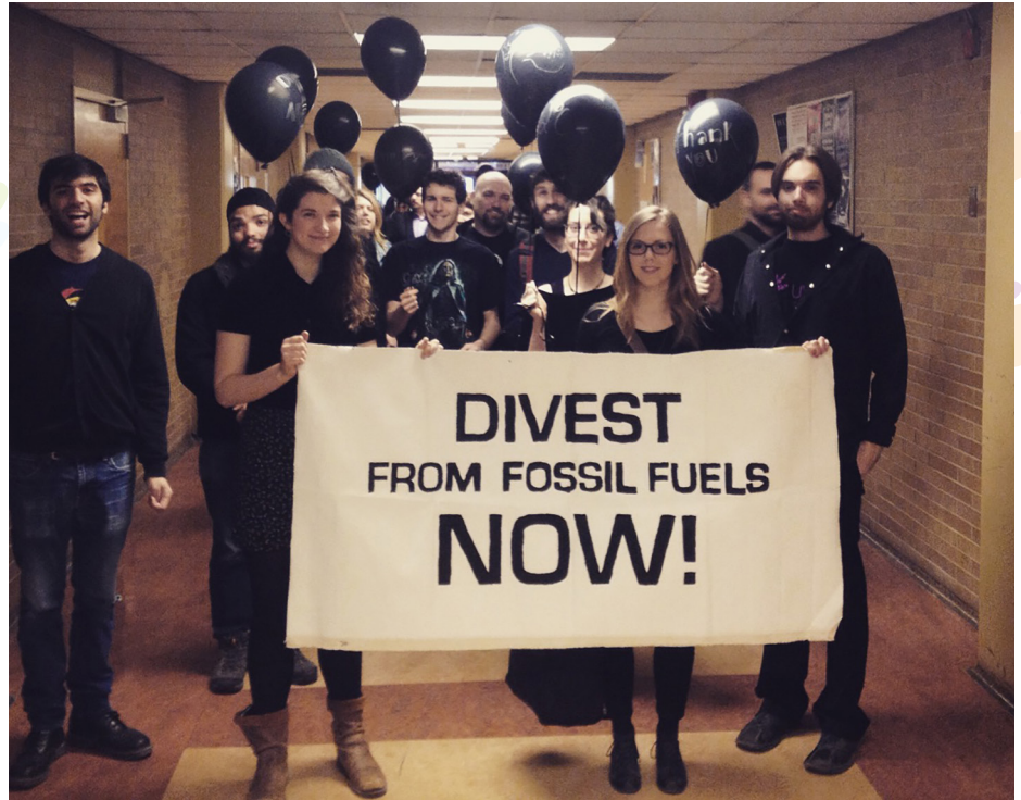
Students rally for #DivestUW at the Board of Regents

The goal of divestment is to convince the University of Winnipeg Foundation to freeze any new investments and begin a process of moving away from existing investments in fossil fuel companies. By supporting this campaign, the UWSA is part of a Canada-wide and global movement. Learn more about Divestment here: www.gofossilfree.ca